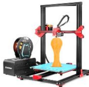
Alfawise U20 / U30 3D Printers