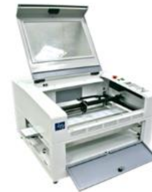
V2000 Laser Cutting & Engraving Machine