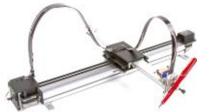
AxiDraw V3/A3 Drawing Machine

At the end of this course, you will be able to program, assemble and design your own robot. Be ready to challenge yourself!